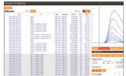
Analysis results after 120-180 seconds